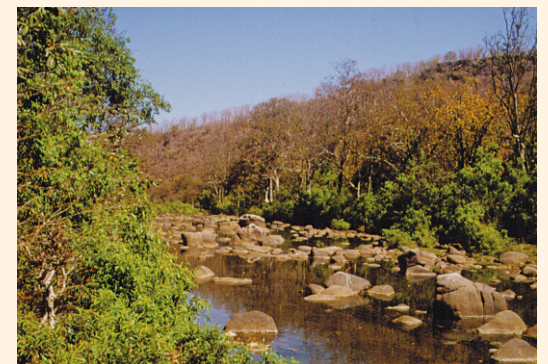
Calm and repose are all pervading at Chitrakoot

Bharat Koop : Bharat Koop is where Bharat stored holy water collected from all the places of pilgrimage in India. It is a small, isolated spot, a few kilometres from town.