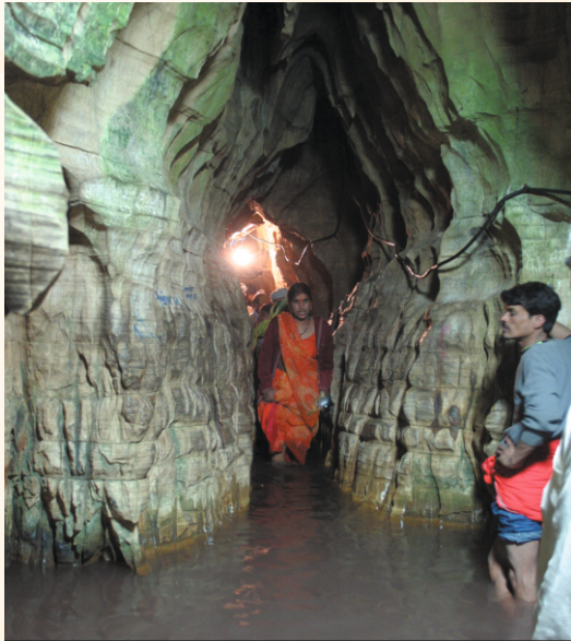
Chitrakoot is sanctified by the faith of pilgrims

Ramghat : The ghats that line the banks of the river Mandakini reveal a constantly moving and changing kaleidoscope of religious activity. Here, amidst the chanting of hymns and the sweet fragrance of incense, holy men in saffron robes sit in silent meditation or offer the solace of their wisdom to the countless pilgrims who converge here. With the very first rays of dawn that gleam upon the river, Ramghat stirs into life as the devout of all ages take the ritual, purifying dip in the