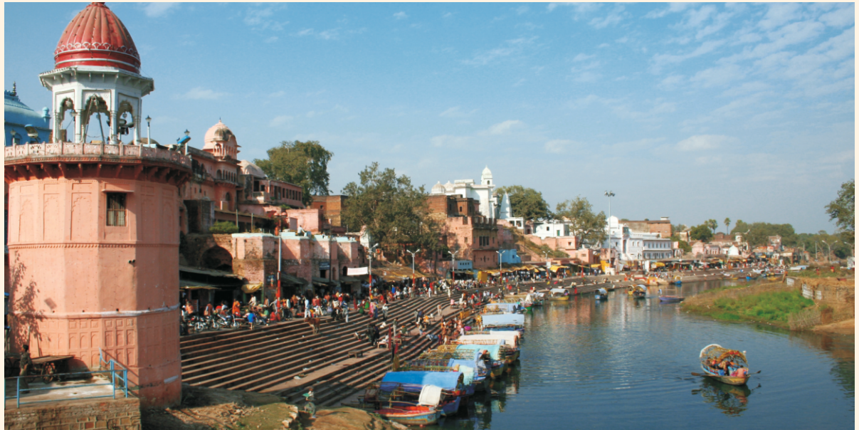
Kaleidoscope of religious activity on the banks of the holy Mandakini

The rippling blue green waters of the Mandakini can be traversed by